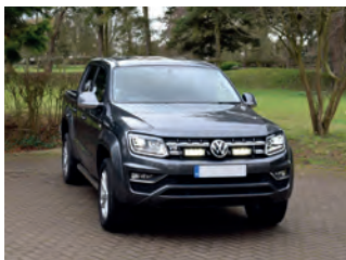
VW AMAROK 2016+