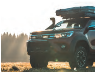
TOYOTA HILUX 2017+