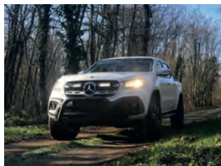
MERCEDES X-CLASS 2016+

Thank you for choosing a Lazer Lamps product. Vielen Dank dafür, dass Sie sich für ein Produkt von Lazer Lamps entschieden haben. Merci pour choisir un produit de Lazer Lamps. Gracias por la seleccion de productos de Lazer Lamps.