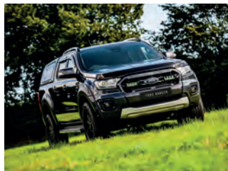
FORD RANGER 2019+